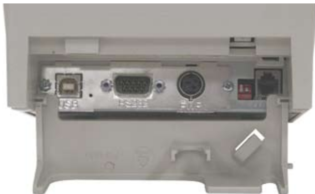
Dual RS232 Serial/USB Interface Shown Above

The A798 represents the next generation of reliable, high performance, low priced receipt printers. Built on CognitiveTPG's reputation for delivering durable printers, the A798 combines exceptional print speed with a small footprint, standard dual interface, and monochrome printing.